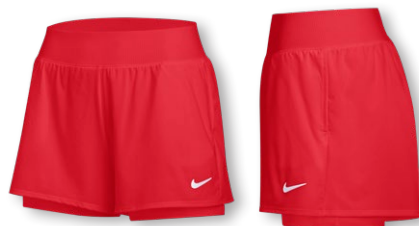
NIKECOURT VICTORY FLEX SHORT DH4922 Page 8