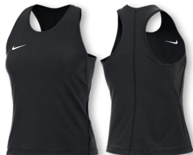
NIKE TEAM DRI-FIT VICTORY TANK FZ5745 Page 7