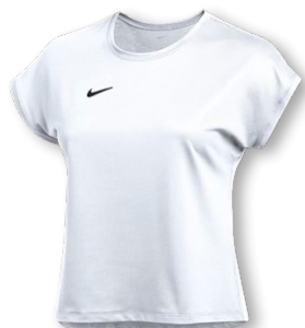
NIKECOURT DRI-FIT VICTORY SS TOP DV3495 Page 8