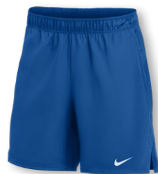
NIKECOURT DRI-FIT SHORT 7IN FZ5652 Page 5