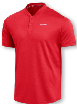
NIKECOURT DRI-FIT POLO DH4933 Page 4