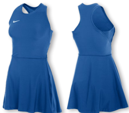
NIKE DRI-FIT VICTORY DRESS FZ5747 Page 6