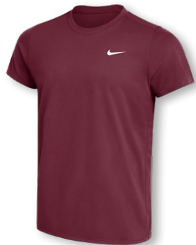
NEW NIKE TEAM DRI-FIT VICTORY SS TOP HV9126 Page 4