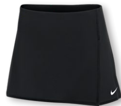
NIKE TEAM DRI-FIT VICTORY SKIRT FZ5746 Page 7